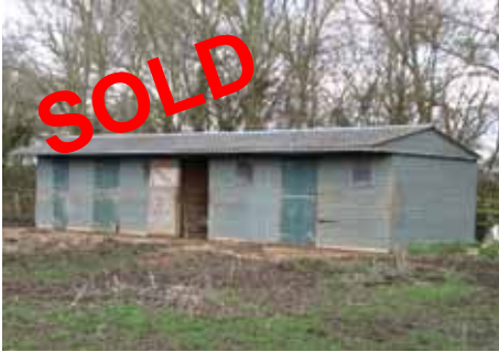
Headcorn - Stables with 2.11 acres SOLD £85,500

Entries invited now for our Auction on Wednesday 20th October