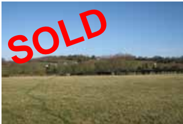
Sissinghurst - 13.5 acres pasture and woodland Sold prior to auction in excess of £100,000