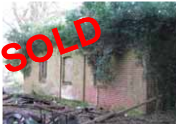
Southborough - Buildings and 7.67 acres Sold prior to auction in excess of £150,000