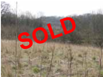
Benenden - 5.2 acres SOLD £50,000

More land needed following our successful Auction results this year