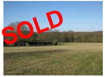
Rochester - 14.40 acres Pasture SOLD £110,000