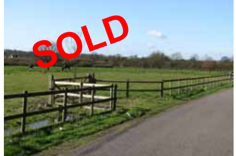
Linton - 10.8 acres Paddocks SOLD £130,000